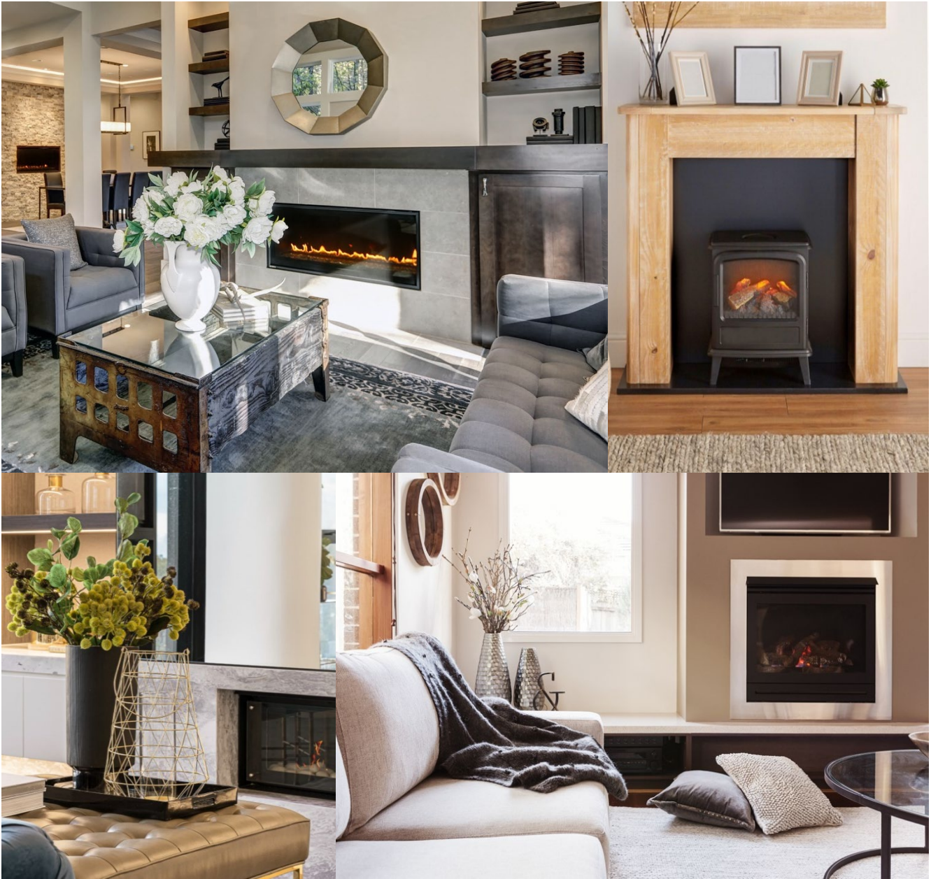
Above – different gas fireplace types and installation settings

Altogether, the reliability, efficiency, and affordability of gas fireplaces makes them a key household heat source in Canada’s energy future.